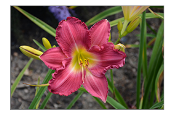
Happy Ever Appster Romantic Returns Daylily flowers