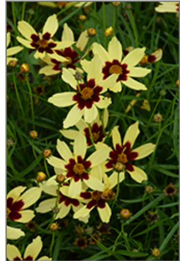
Electric Sunshine Tickseed flowers