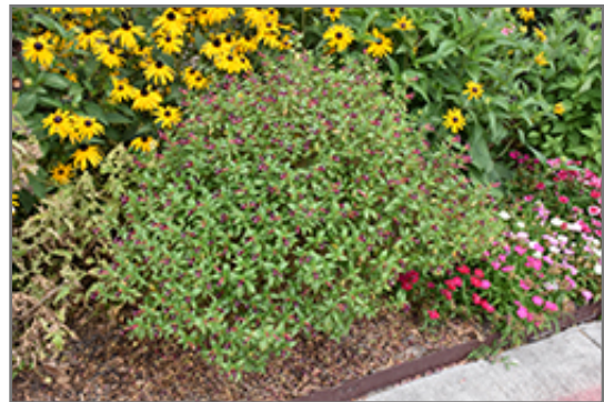
Ballistic Cuphea in bloom