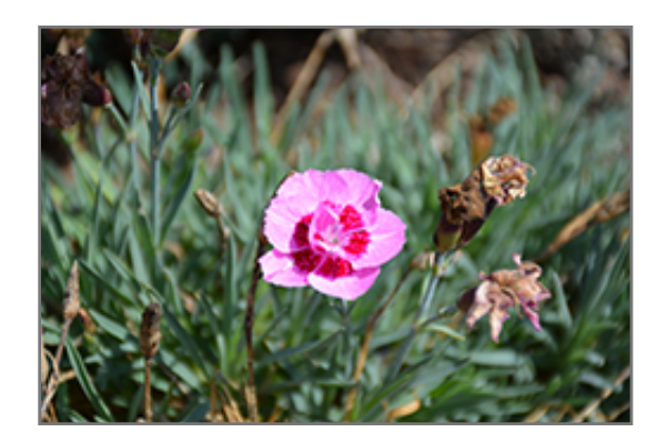
EverLast Light Pink plus Eye Pinks flowers