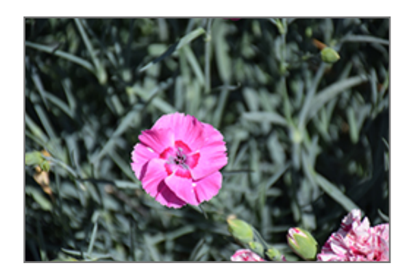
Mountain Frost Pink Carpet Pinks flowers