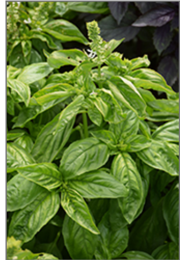
Genovese Basil foliage

This plant can be integrated into a landscape or flower garden by creative gardeners, but is usually grown in a designated herb garden. It should only be grown in full sunlight. It prefers to grow in average to moist conditions, and shouldn't be allowed to dry out. It is not particular as to soil type or pH. It is somewhat tolerant of urban pollution. This is a selected variety of a species not originally from North America. It can be propagated by cuttings; however, as a cultivated variety, be aware that it may be subject to certain restrictions or prohibitions on propagation.