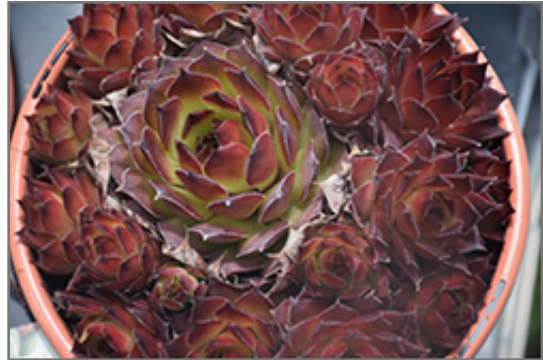
Black Hens And Chicks

Black Hens And Chicks is a fine choice for the garden, but it is also a good selection for planting in outdoor pots and containers. It is often used as a 'filler' in the 'spiller-thriller-filler' container combination, providing a canvas of foliage against which the larger thriller plants stand out. Note that when growing plants in outdoor containers and baskets, they may require more frequent waterings than they would in the yard or garden.