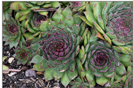
Black Hens And Chicks