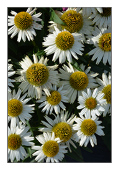
Meditation White Coneflower flowers