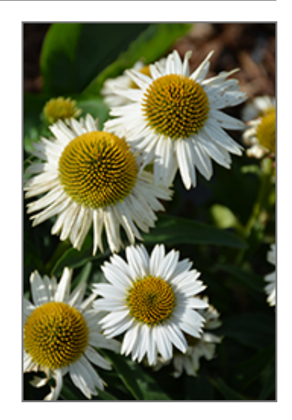
Meditation White Coneflower flowers