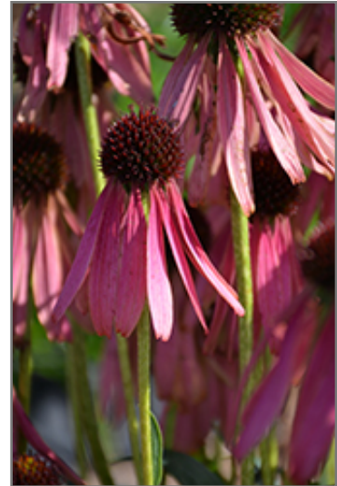
Rocket Man Coneflower flowers