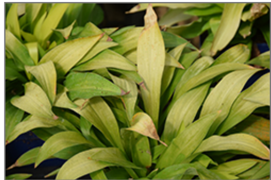
Munchkin Fire Hosta foliage