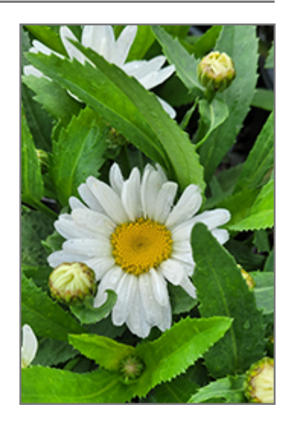
Western Star Taurus Shasta Daisy flowers