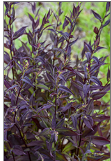
Lady In Black Calico Aster