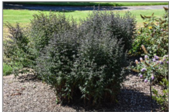
Prince Calico Aster