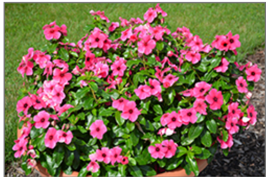
Tattoo Raspberry Vinca in bloom