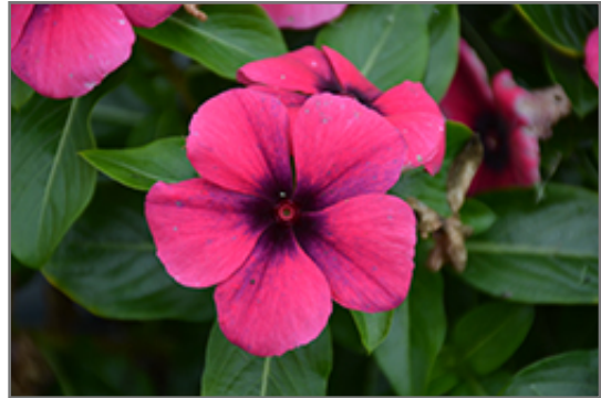
Tattoo Raspberry Vinca flowers

Tattoo Raspberry Vinca is recommended for the following landscape applications;