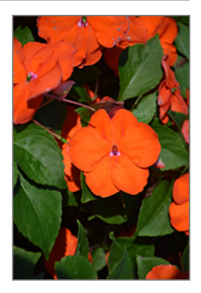
Beacon Orange Impatiens flowers