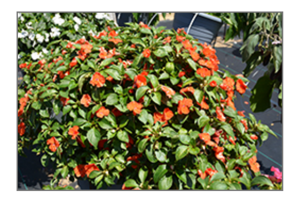
Beacon Orange Impatiens in bloom