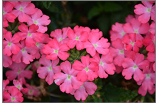
Firehouse Pink Verbena flowers