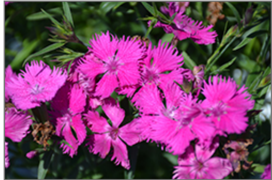
Rockin' Purple Pinks flowers

Rockin' Purple Pinks is recommended for the following landscape applications;