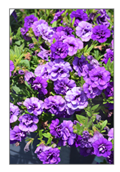
Superbells Double Blue Calibrachoa flowers