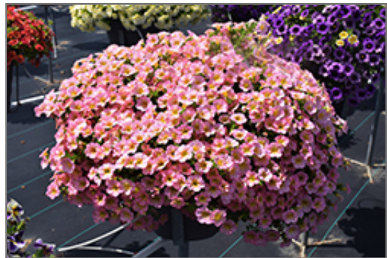
Superbells Honeyberry Calibrachoa in bloom