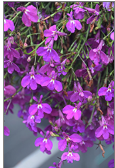
Laguna Ultraviolet Lobelia flowers