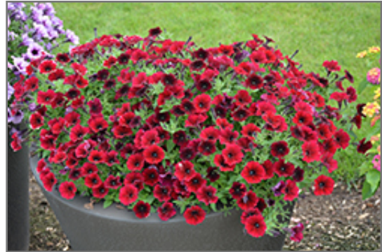
Supertunia Black Cherry Petunia in bloom

Supertunia Black Cherry Petunia will grow to be about 10 inches tall at maturity, with a spread of 24 inches. When grown in masses or used as a bedding plant, individual plants should be spaced approximately 16 inches apart. Its foliage tends to remain low and dense right to the ground. This fast-growing annual will normally live for one full growing season, needing replacement the following year.