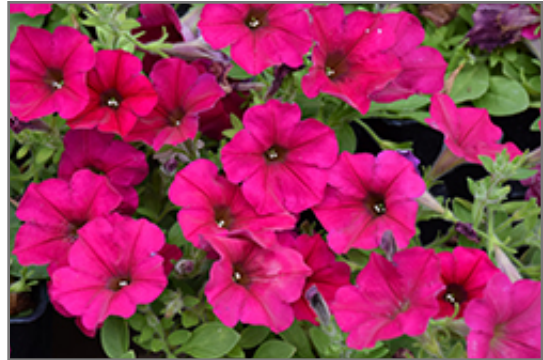
Wave Carmine Velour Petunia flowers

Wave Carmine Velour Petunia is recommended for the following landscape applications;