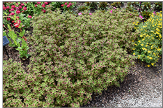
ColorBlaze Chocolate Drop Coleus