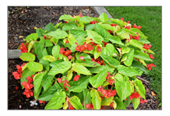
Canary Wings Begonia in bloom