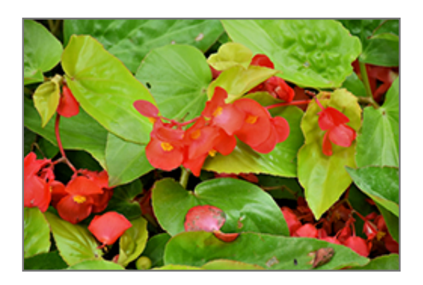
Canary Wings Begonia flowers

17999 WCR 4 Brighton, CO, 80603 phone: 303-775-9629 www.incolorme.com