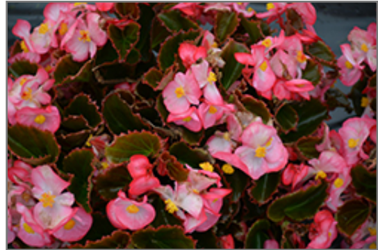
Senator IQ Rose Bicolor flowers

Senator IQ Rose Bicolor is recommended for the following landscape applications;