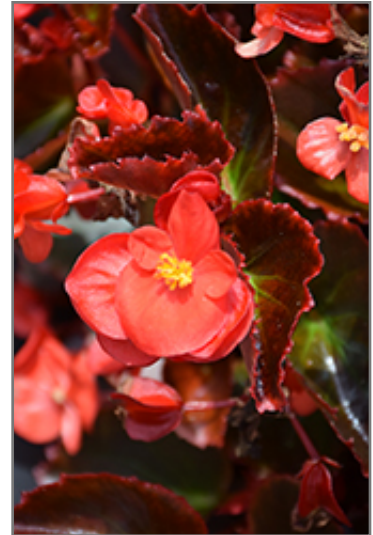
Senator IQ Scarlet flowers

Senator IQ Scarlet is recommended for the following landscape applications;