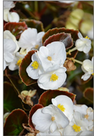
Senator IQ White flowers

Senator IQ White is recommended for the following landscape applications;