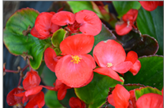
Topspin Scarlet Begonia flowers

Topspin Scarlet Begonia is recommended for the following landscape applications;