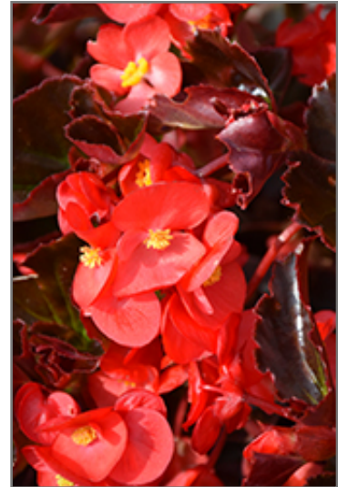
Viking Red on Chocolate Begonia flowers