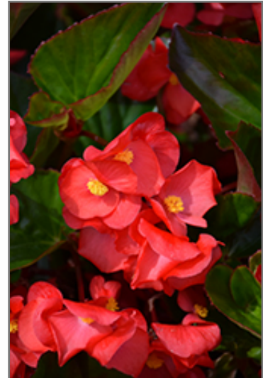
Viking XL Red on Green Begonia flowers