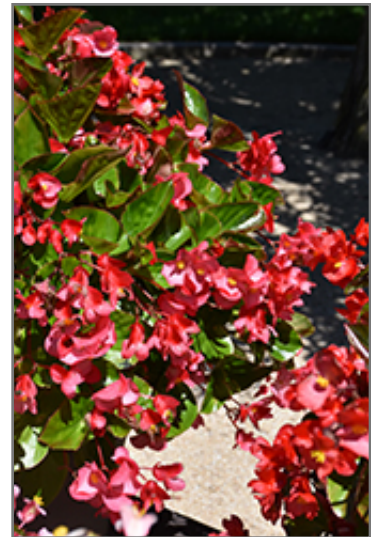
Viking XL Rose on Green Begonia flowers