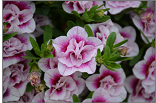
MiniFamous Uno Double PinkTastic Calibrachoa flowers

This plant will require occasional maintenance and upkeep. Trim off the flower heads after they fade and die to encourage more blooms late into the season. It is a good choice for attracting bees and butterflies to your yard, but is not particularly attractive to deer who tend to leave it alone in favor of tastier treats. It has no significant negative characteristics.