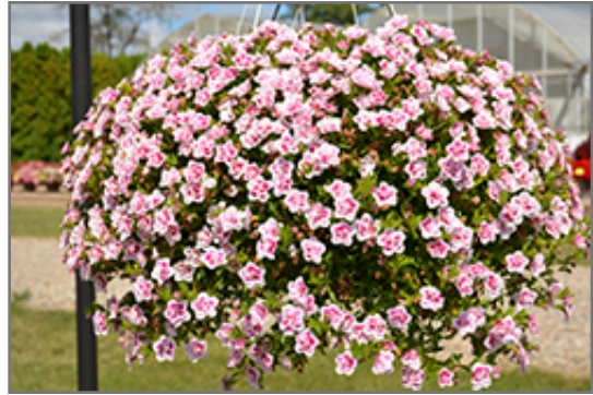
MiniFamous Uno Double PinkTastic Calibrachoa in bloom

MiniFamous Uno Double PinkTastic Calibrachoa is a fine choice for the garden, but it is also a good selection for planting in outdoor containers and hanging baskets. Because of its trailing habit of growth, it is ideally suited for use as a 'spiller' in the 'spiller-thriller-filler' container combination; plant it near the edges where it can spill gracefully over the pot. Note that when growing plants in outdoor containers and baskets, they may require more frequent waterings than they would in the yard or garden.