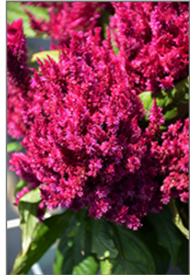
First Flame Purple Celosia flowers