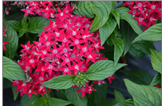
Lucky Star Raspberry Star Flower flowers