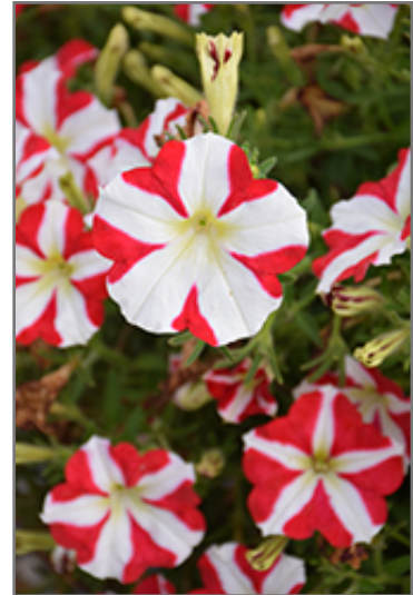
Amore King of Hearts Petunia flowers

Amore King of Hearts Petunia is recommended for the following landscape applications;