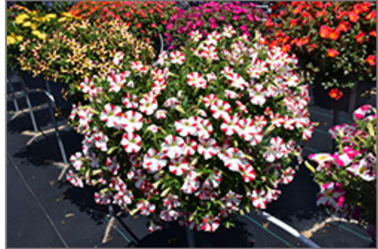
Amore King of Hearts Petunia in bloom

Amore King of Hearts Petunia will grow to be about 12 inches tall at maturity, with a spread of 14 inches. When grown in masses or used as a bedding plant, individual plants should be spaced approximately 10 inches apart. Its foliage tends to remain dense right to the ground, not requiring facer plants in front. This fast-growing annual will normally live for one full growing season, needing replacement the following year.