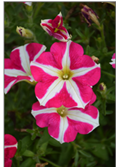
Amore Pink Heart Petunia flowers