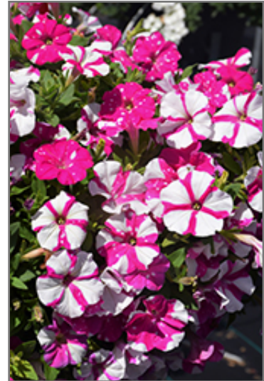
Headliner Pink Sky Petunia flowers