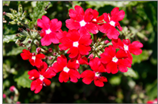
Cadet Upright Red Verbena flowers