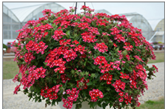
Cadet Upright Red Verbena in bloom