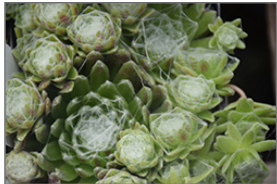
Cobweb Buttons Hens And Chicks