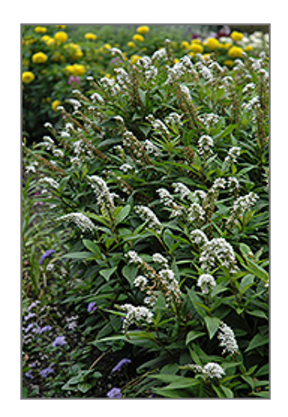
Gooseneck Loosestrife in bloom