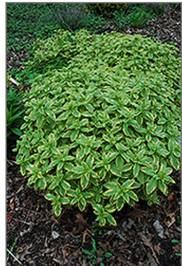
Golden Alexander Loosestrife