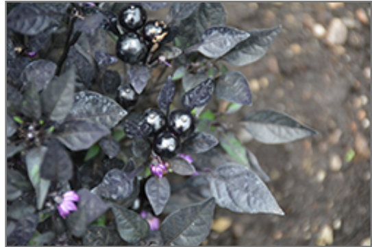
Onyx Red Ornamental Pepper fruit

Onyx Red Ornamental Pepper is an herbaceous annual with an upright spreading habit of growth. Its medium texture blends into the garden, but can always be balanced by a couple of finer or coarser plants for an effective composition.