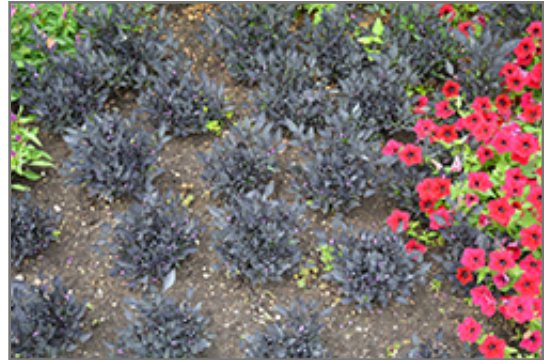
Onyx Red Ornamental Pepper