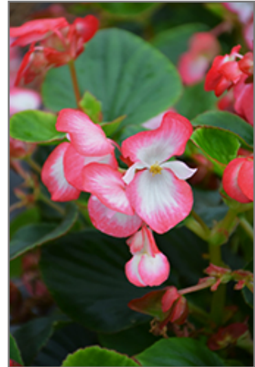
Volumia Rose Bicolor Begonia flowers

Volumia Rose Bicolor Begonia is recommended for the following landscape applications;