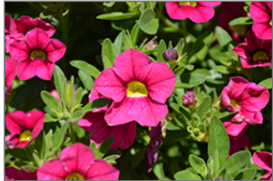
Calitastic Fancy Fuchsia Calibrachoa flowers