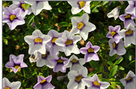
Calitastic Ice Blue Calibrachoa flowers