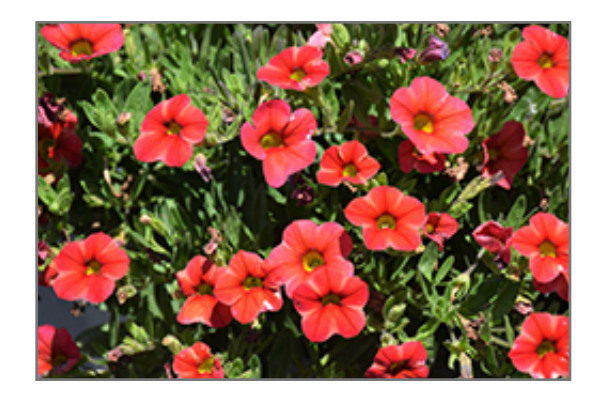
Callie Star Orange Calibrachoa flowers