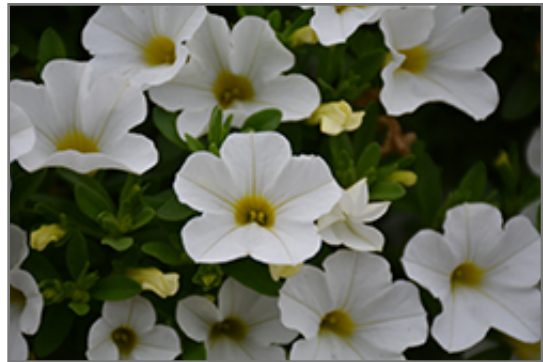
MiniFamous Uno White Calibrachoa flowers