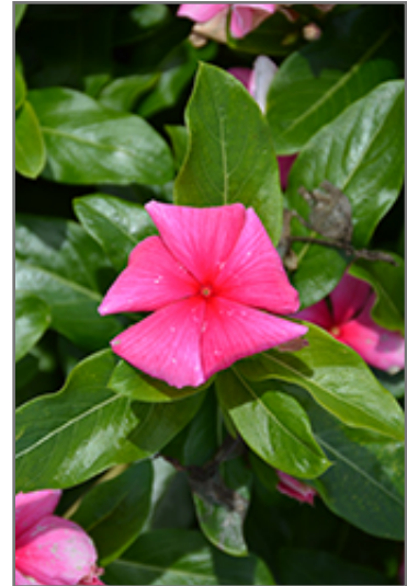
Cora XDR Deep Strawberry flowers

Cora XDR Deep Strawberry is recommended for the following landscape applications;