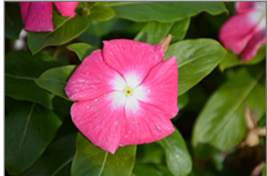
Cora XDR Pink Halo flowers