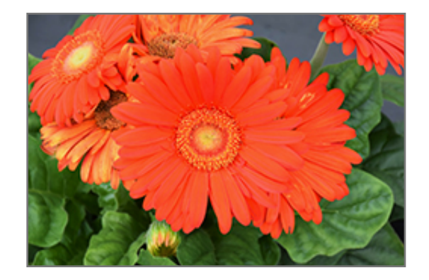
Bengal Orange Gerbera Daisy flowers